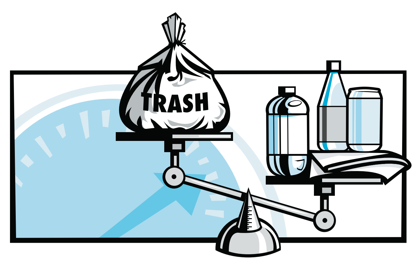
Part 3: How much of the school's waste can be recycled?